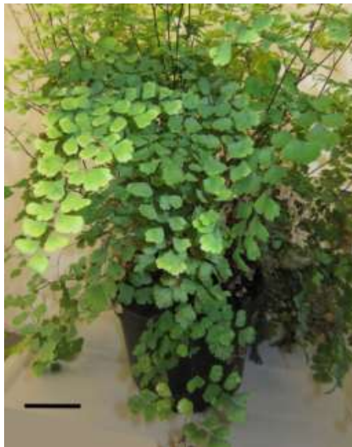
Figure 1. Foliage of A. capillus-veneris in laboratory cultivation. Scale bar = 4 cm.

of locations, but also grows effectively as a lithophyte on moist or wet rocks (Punetha et al., 2013). Fossil evidence indicates the presence of Adiantum spp. in the Miocene, ca. 23 to 5 million years ago, at geographic locations where paleontological evidence suggests the climate was warm and humid (Yao et al., 2011).